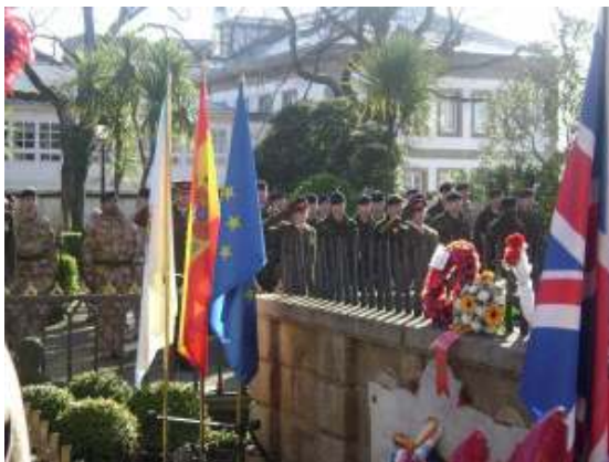
3/29 Corunna Battery Royal Artillery

The bicentenary commemoration at La Coruña over the period 13 th – 18 th January 2009 was the first major event in Spain to mark the 200 th anniversary of the battles and sieges of the Peninsular War. The Battle at La Coruña has particular significance to the British armed forces: it was the only battle of the war fought in Spain purely between the French and British armies, both sides claiming victory; it followed a harrowing retreat and subsequent evacuation by the Royal Navy, akin to Dunkirk in May 1940; and it resulted in the loss of a much admired Commander in Chief, Lt Gen Sir John Moore KB.