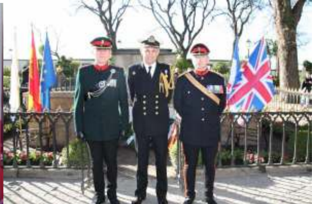
Infantry, Royal Navy & Royal Artillery – key components to the Battle at La Coruña