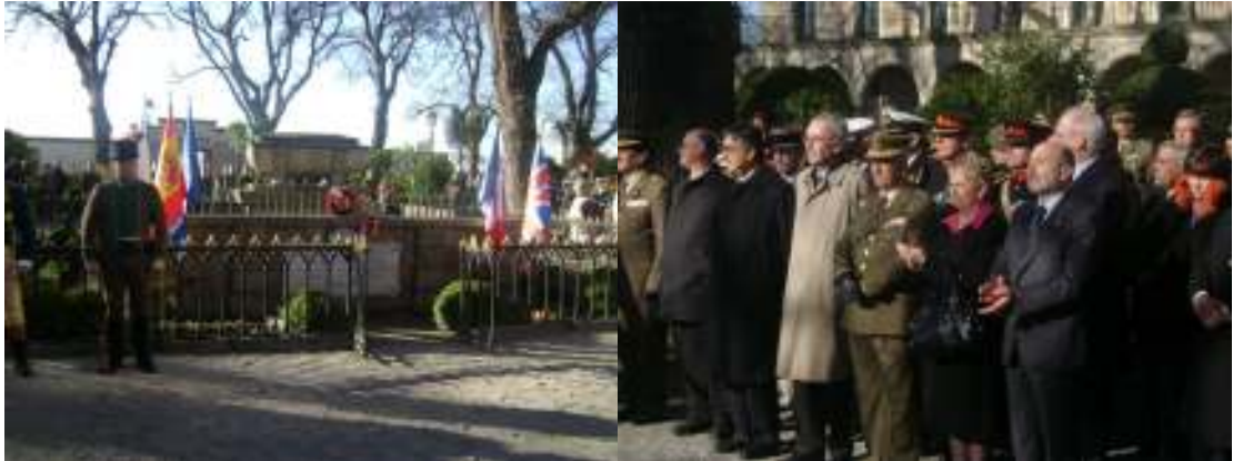
The tomb of Sir John Moore – San Carlos gardens The Mayor, British Ambassador & French Consul

very warmly received. The soldiers, and more junior officers, were invited to a separate function and were hosted most generously in the centre of the old town.