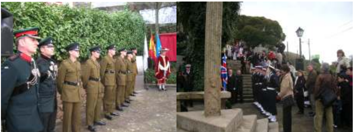
The Rifles at La Elviña ceremony